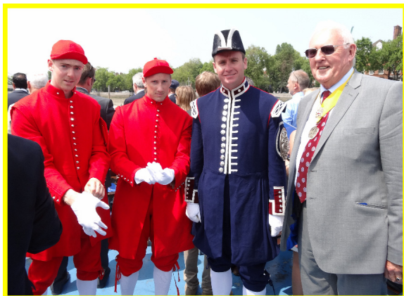
Doggett's Men and Company Bargemaster