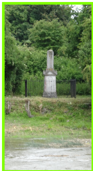
The Hawkwood Stone, River Medway