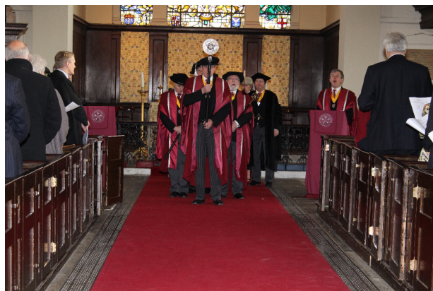
'Jerusalem !' Recessional