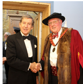
Our new High Steward at his first Manor event