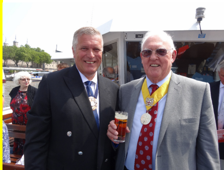
Deputy Master Waterman