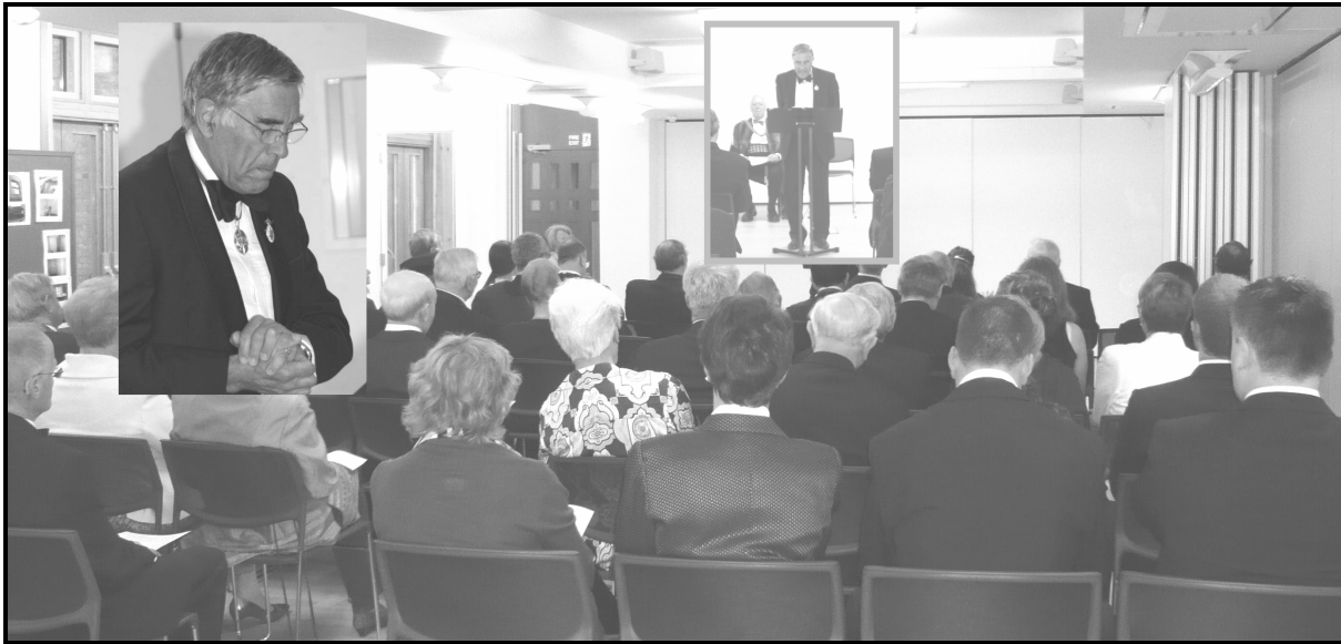
above: Lecture "The First Six Months of the Supreme Court" by Lord Phillips