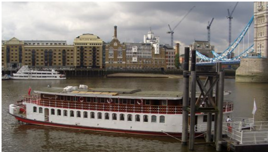
MV Mercia – the floating venue for the Water Race of the Apprentices of the Watermen and Lightermen