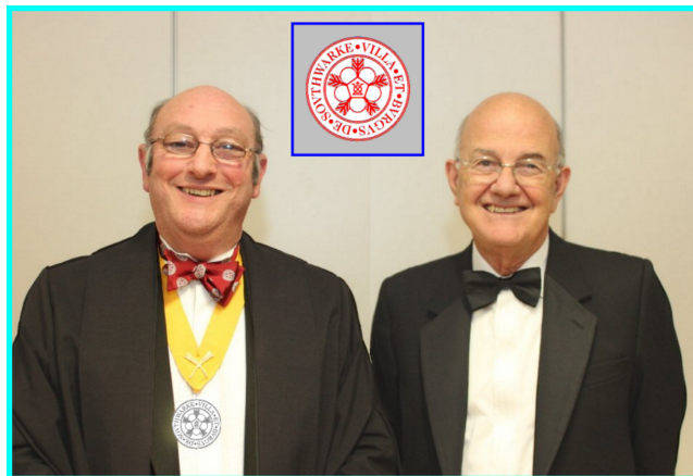
The Learned Clerk and Lord Judge LCJ