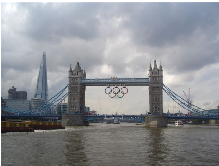
View from the Bridge of MV Mercia of the Olympic Bridge as the 'Gateway to Southwark' !!!